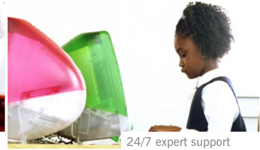
24/7 expert support