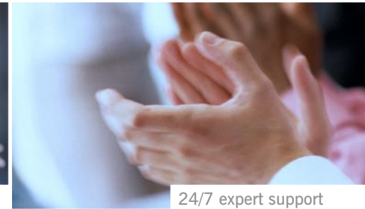
24/7 expert support